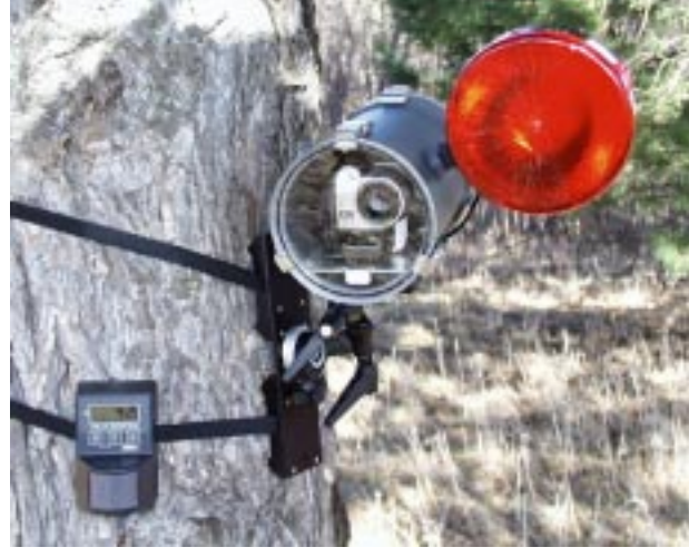
The TM700v Passive Infrared Video Trail Monitor can be easily mounted to a tree or post. This photo shows the TM700v mounted with the TM Video Camera, the TM Weather-Proof Video Enclosure, and the TM Video Light. The light is pictured here with the red light cover. Clear and infrared light covers are also available with the system.

RECEIVER 4.75'L x 3.25"W x 3.25"D Weight: 12 oz. Power: 4 c-cell batteries (ALKALINE)