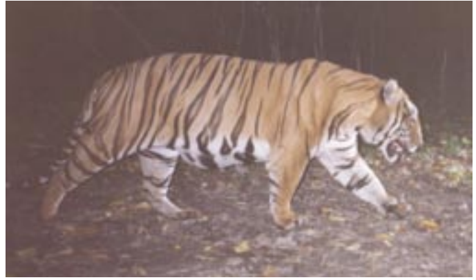
Figure 4. Indian tigers, like many other cats, display coat patterns that vary from animal to animal. Paired camera-trap images like these can thus be used to identify individuals.

of the world's leading experts on tigers, and James D. Nichols, a statistician at the U.S. Geological Survey Patuxent Wildlife Research Center, showed that camera traps and the appropriate analytical software could together be used to estimate the population density of tigers in India.