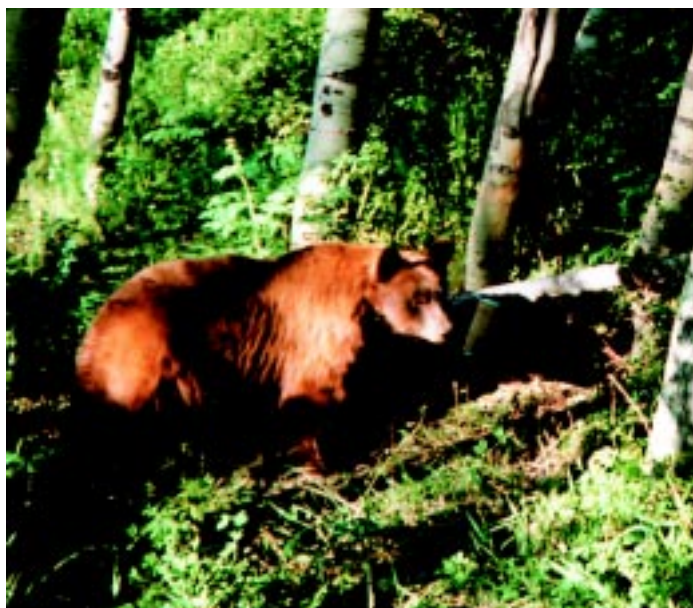
with TRAILMASTER

RECEIVER 4.75" L x 3.25" W x 3.25" D Weight: 12 oz. Power: 4 c-cell batteries (ALKALINE)