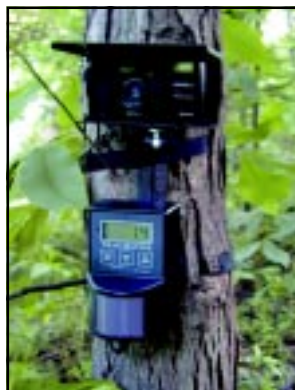
TM550 with TM35-1 Camera Kit